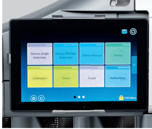
Top: With a 10-inch touch display as operation panel, the BPS C6 provides a brand new experience of human-computer interaction on a desktop sorting machine.

Left: The heart of the BPS C6 is the high-tech sensor technology. The full-face scanning of both sides of each banknote allows it to detect counterfeit and sort for fitness effectively.