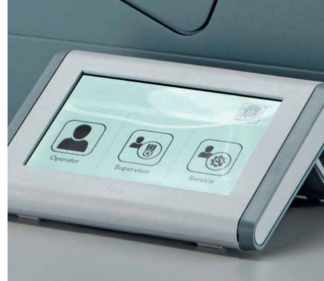
Top: The touch screen enables particularly simple and intuitive operation thanks to its graphical user interface; it can be positioned flexibly by the operator.

Left: The large feeder holds up to 1,500 banknotes, ensuring a continuous workflow.